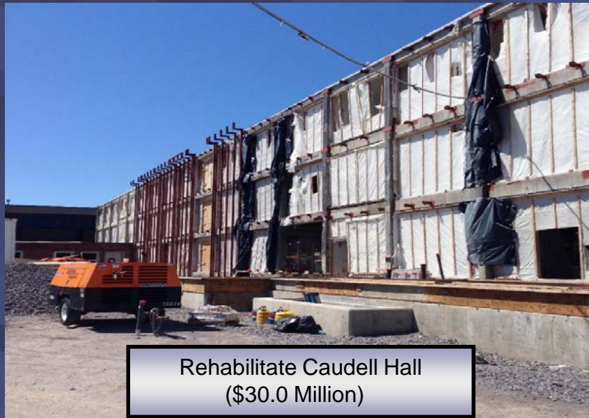
Rehabilitate Caudell Hall ($30.0 Million)