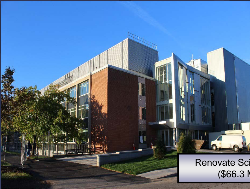
Renovate Science Building ($66.3 Million)