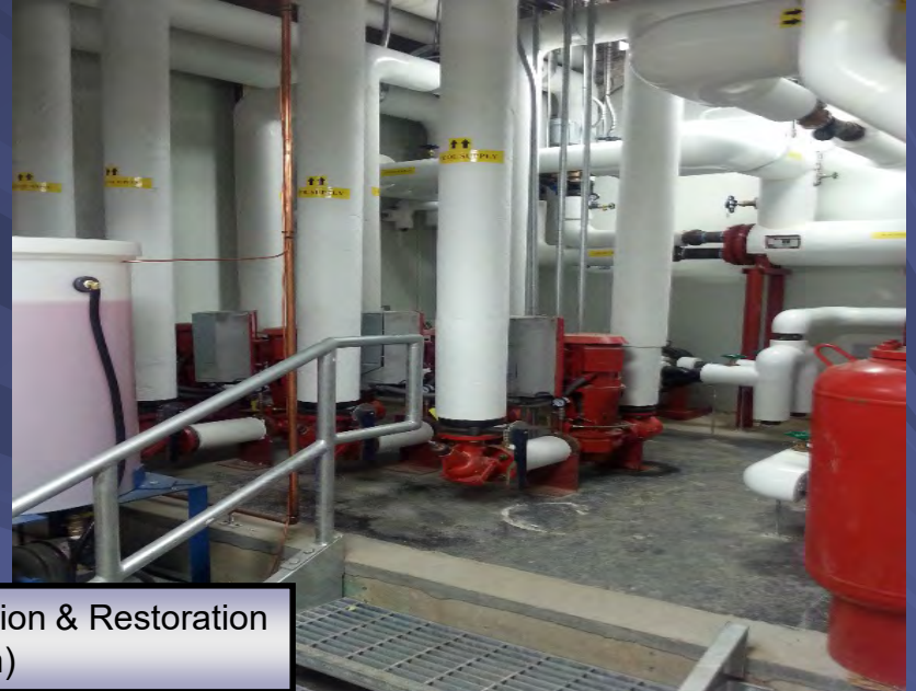
Cook Hall Building Stabilization & Restoration ($4.5 Million)