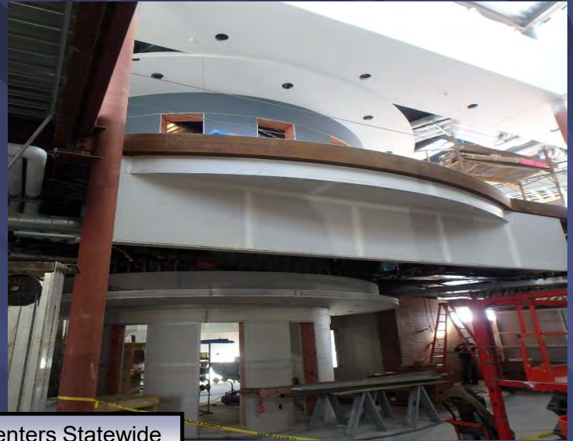
Construct Regional Centers Statewide ($31.1 Million)