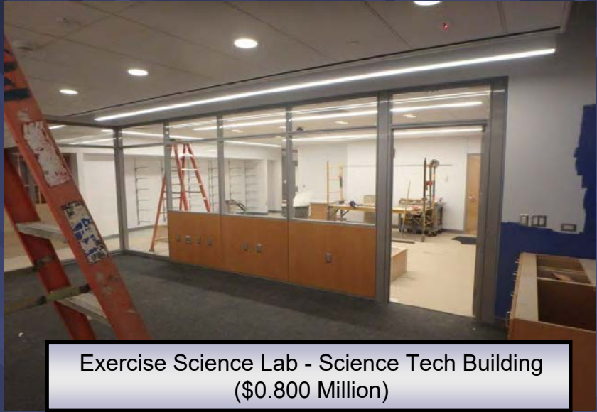
Exercise Science Lab - Science Tech Building ($0.800 Million)