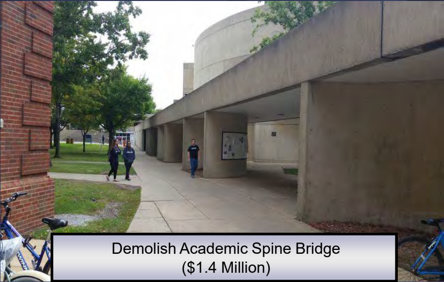
Demolish Academic Spine Bridge ($1.4 Million)