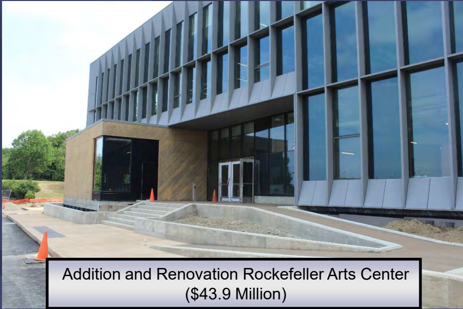
Addition and Renovation Rockefeller Arts Center ($43.9 Million)