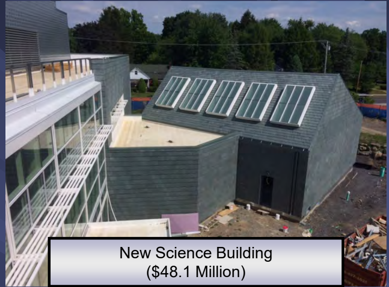
New Science Building ($48.1 Million)