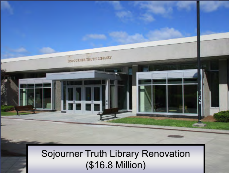
Sojourner Truth Library Renovation ($16.8 Million)