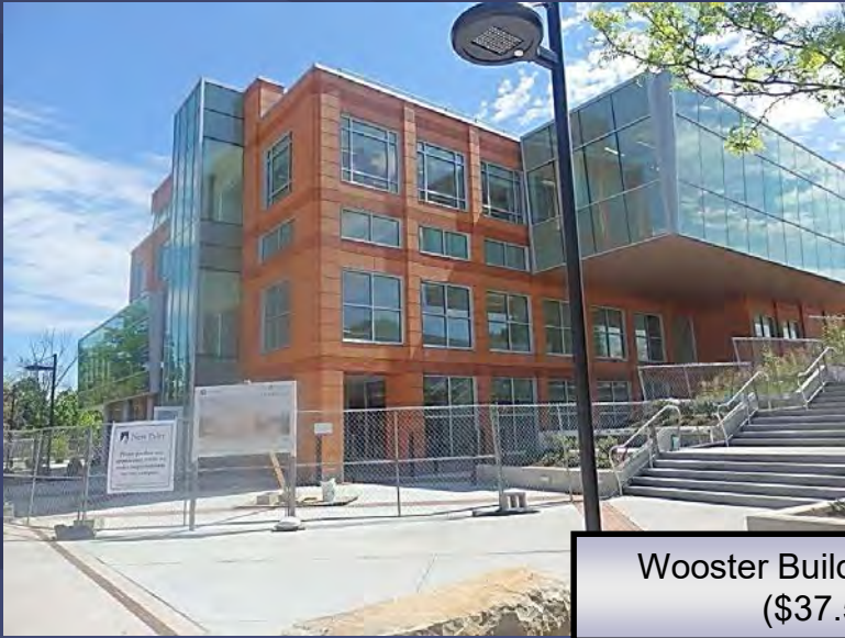
Wooster Building Renovations ($37.5 Million)