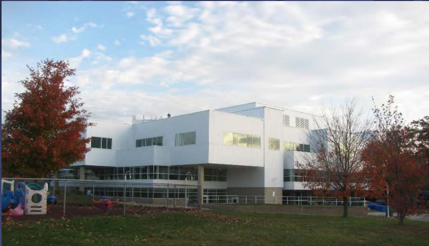
Replace Campus Center Envelope Building 51&56 ($21.3 Million)