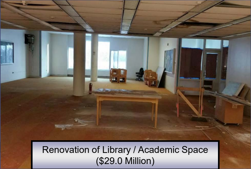
Renovation of Library / Academic Space ($29.0 Million)