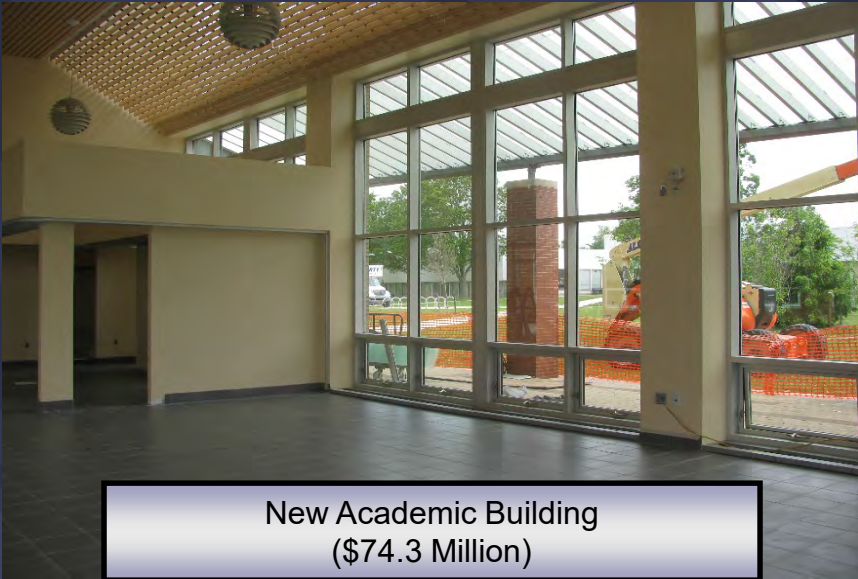
New Academic Building ($74.3 Million)