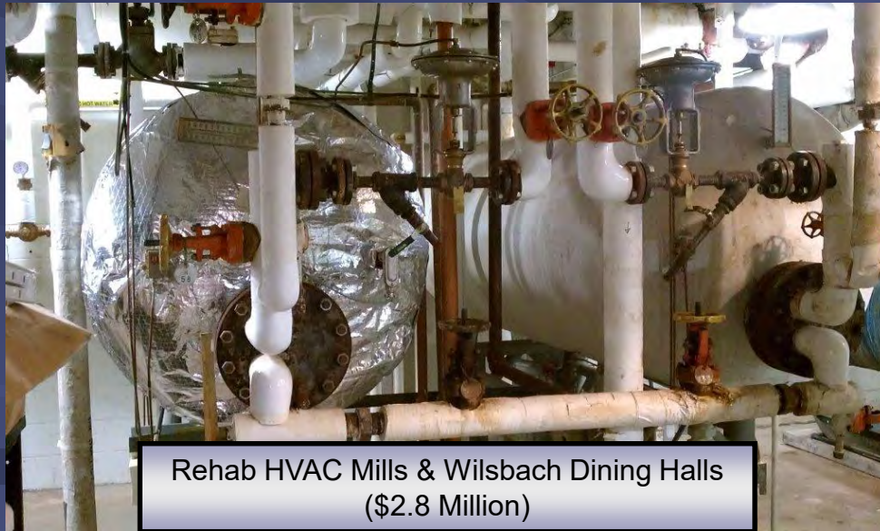
Rehab HVAC Mills & Wilsbach Dining Halls ($2.8 Million)