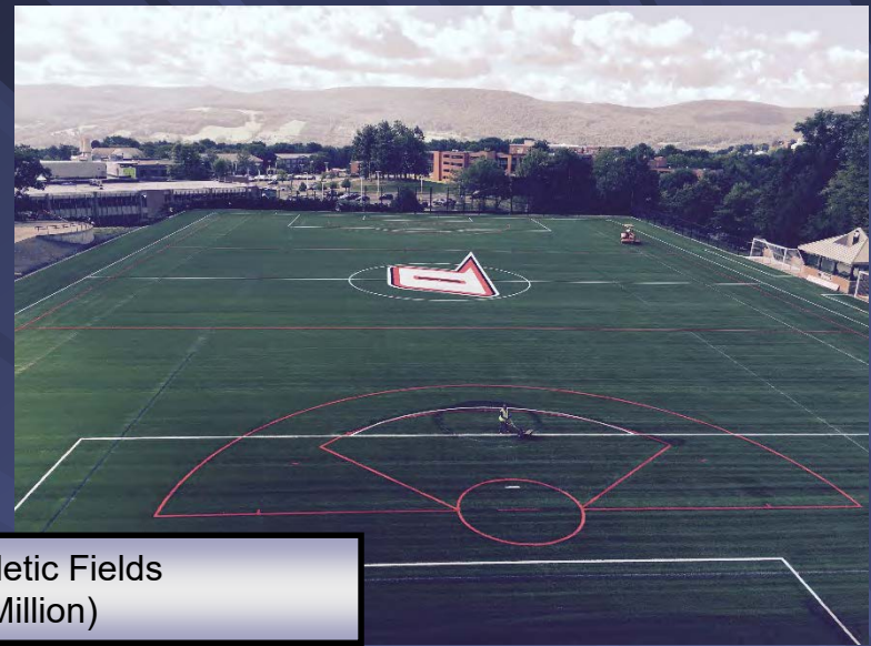
Rehab Athletic Fields ($2.4 Million)