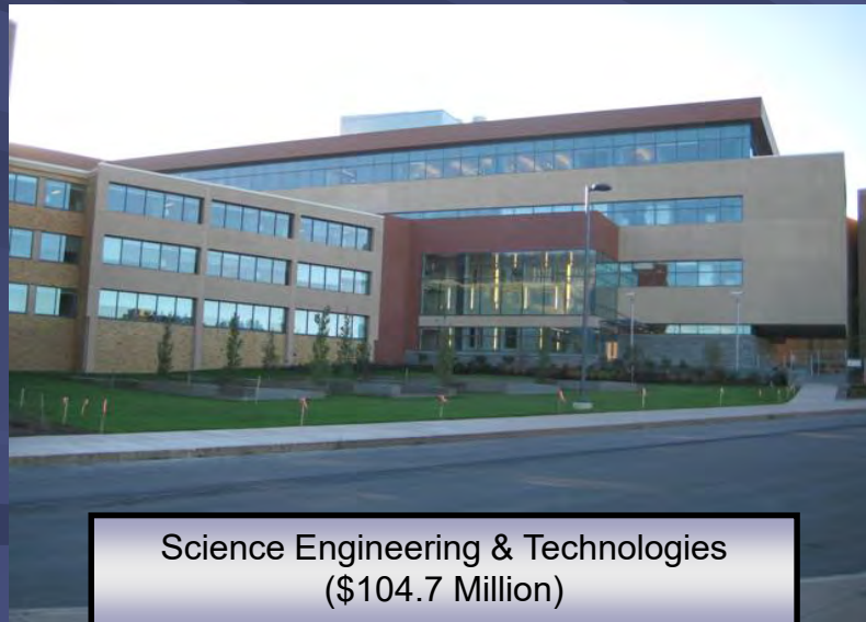
Science Engineering & Technologies ($104.7 Million)