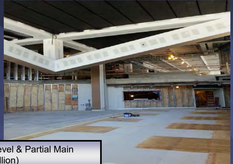
Tyler Rehab - Lower Level & Partial Main ($30.4 Million)