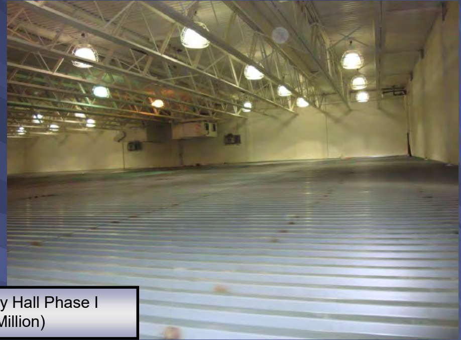
Renovate Sibley Hall Phase I ($10.4 Million)