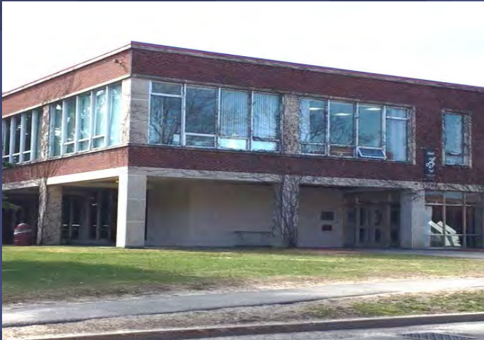
Restore Exterior Envelope Kellas & Thatcher ($1.1 Million)