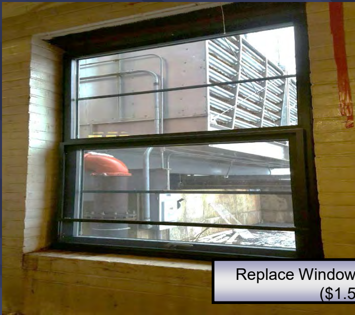
Replace Windows, Various Buildings ($1.5 Million)