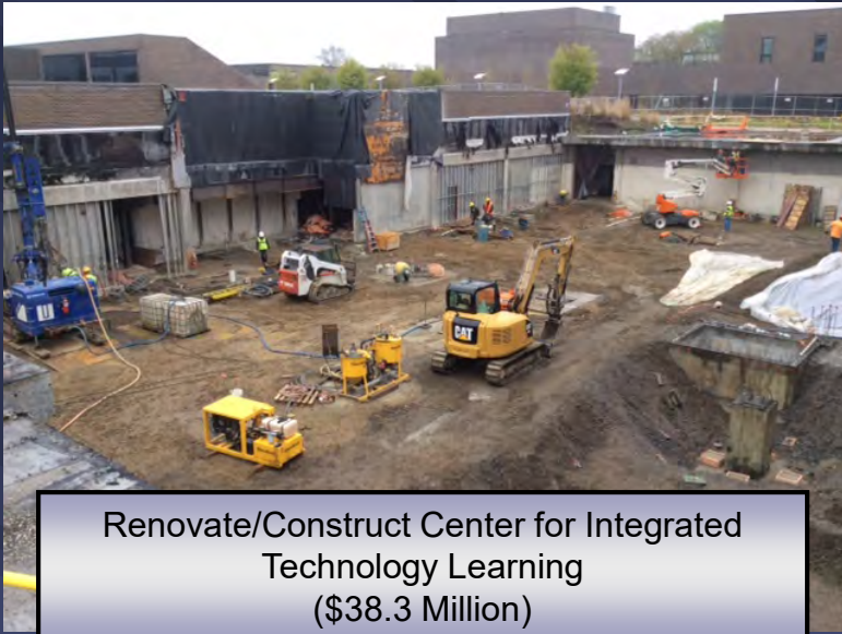
Renovate/Construct Center for Integrated Technology Learning ($38.3 Million)