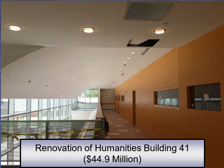
Renovation of Humanities Building 41 ($44.9 Million)