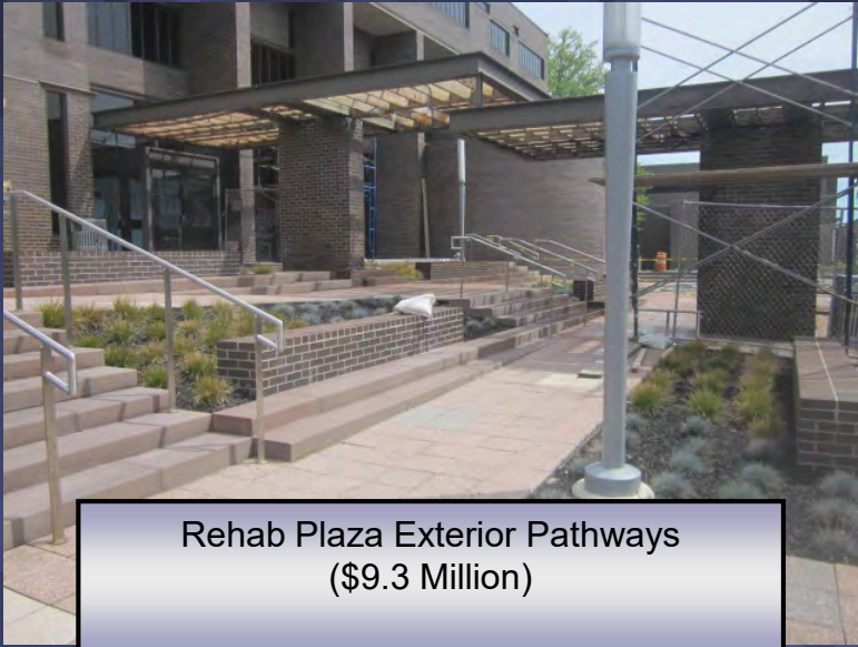
Rehab Plaza Exterior Pathways ($9.3 Million)