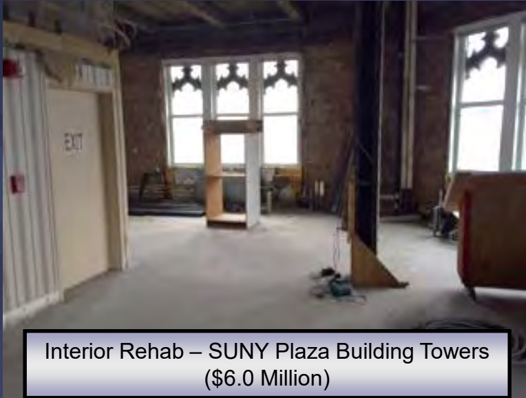
Interior Rehab – SUNY Plaza Building Towers ($6.0 Million)