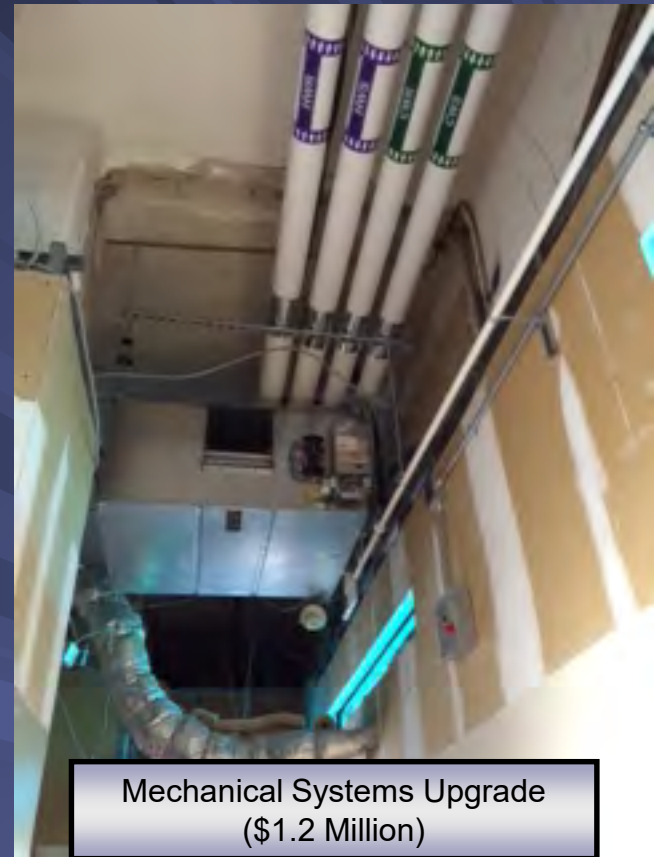
Mechanical Systems Upgrade ($1.2 Million)