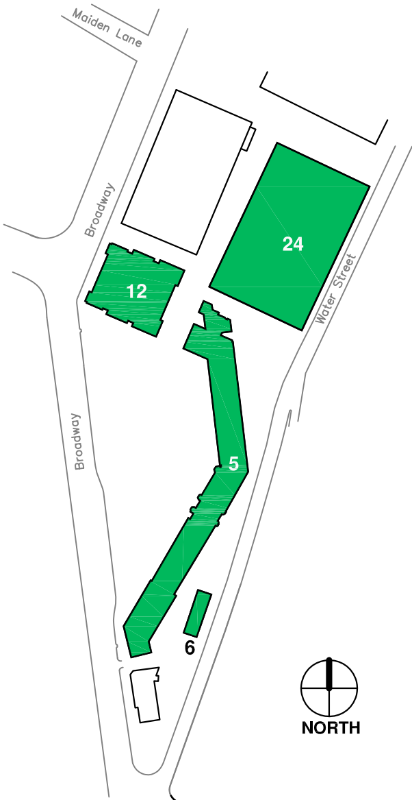
State University Plaza 353 Broadway, Albany NY