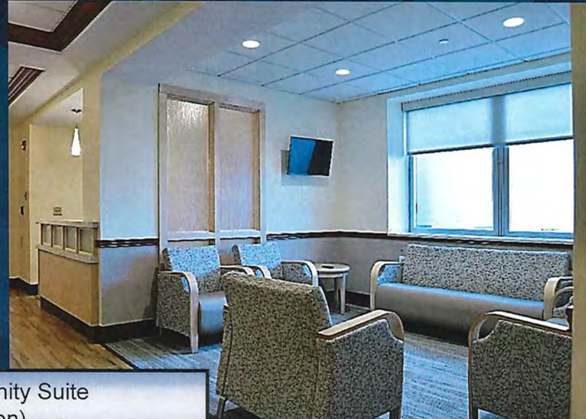
Renovate Maternity Suite ($8.5 Million)