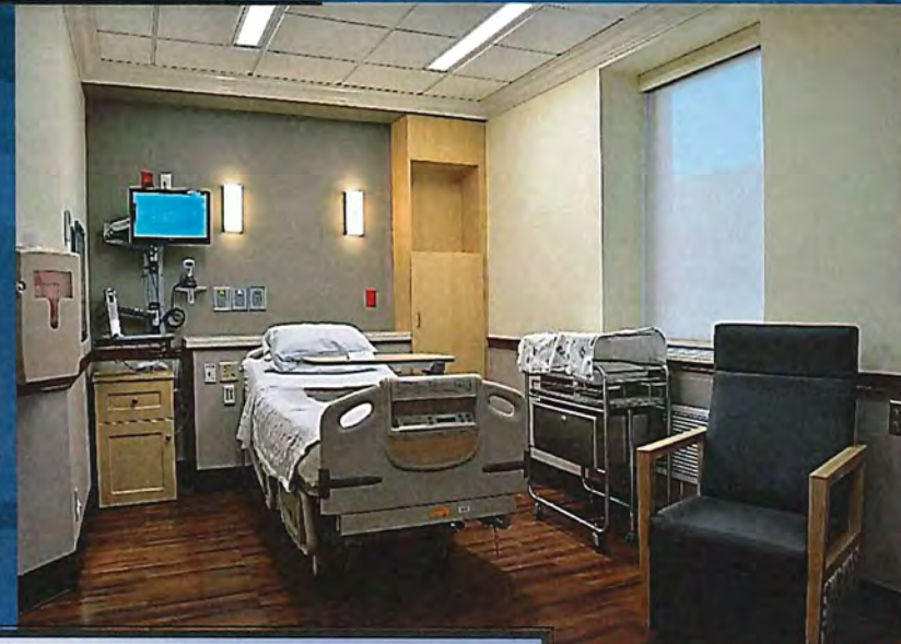
University Hospital at Syracuse