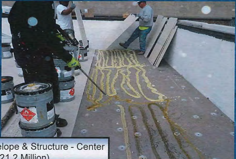
Rehabilitate Exterior Envelope & Structure - Center for the Arts (21.2 Million)