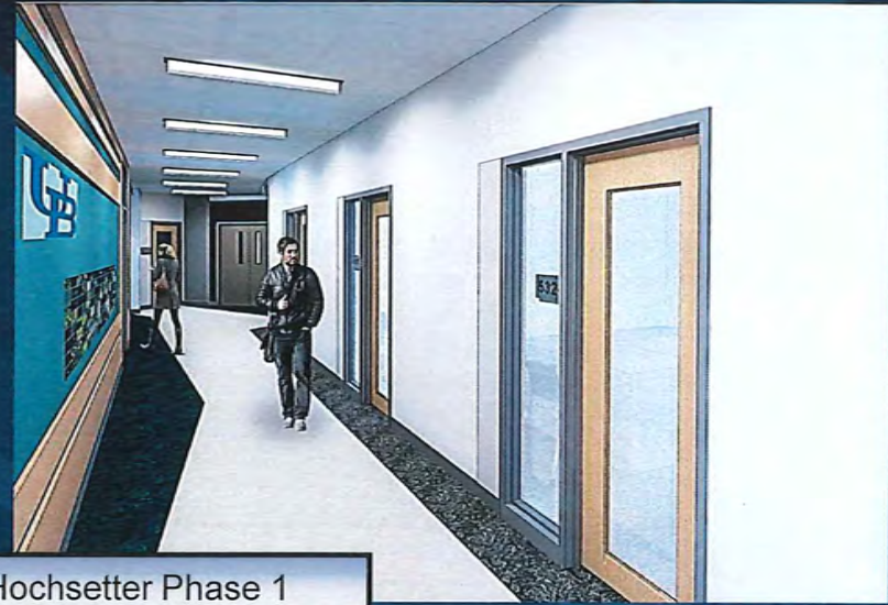
Renovate Cooke/Hochsetter Phase 1 ($14.0 Million)