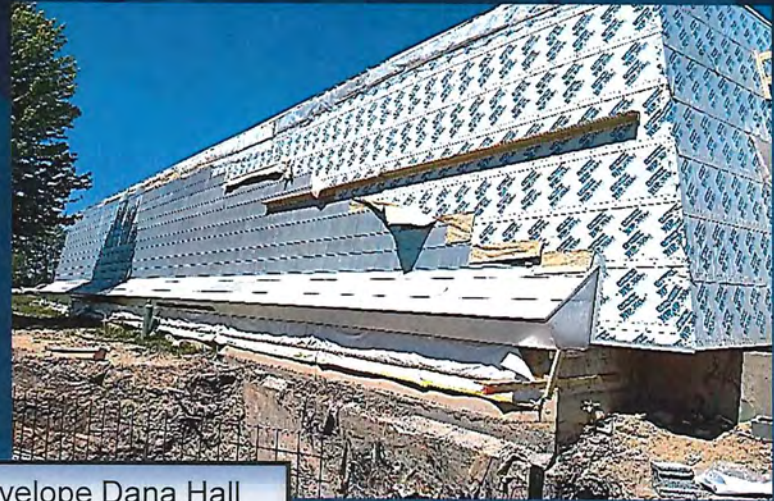
Rehabilitate Exterior Envelope Dana Hall ($4.0 Million)