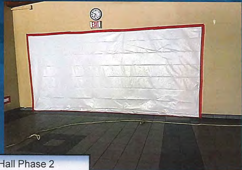
Renovate Chaney Hall Phase 2 (8.6 Million)