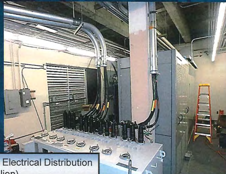
Reconstruct Campus Wide Electrical Distribution ($19.8 Million)