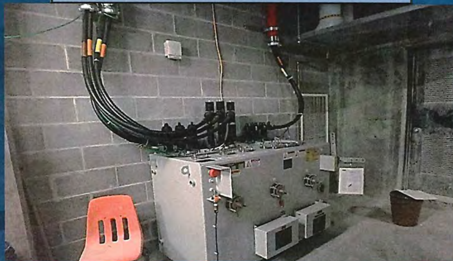
College at Cortland