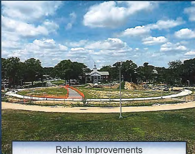
Rehab Improvements Great Mall ($6.4 Million)