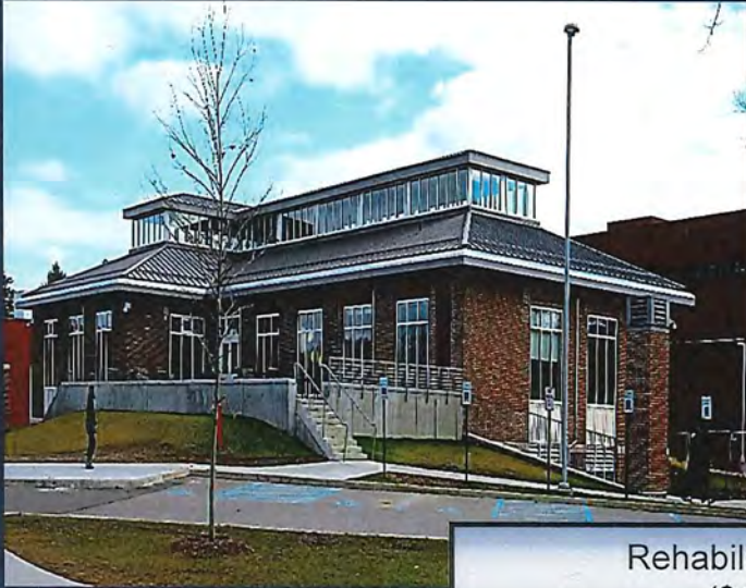
Rehabilitate Conklin Hall ($15.3 Million)