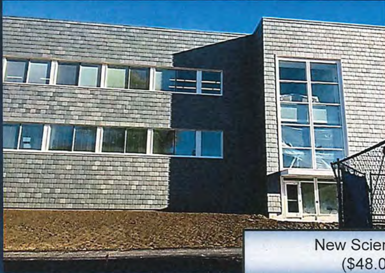
New Science Building ($48.0 Million)