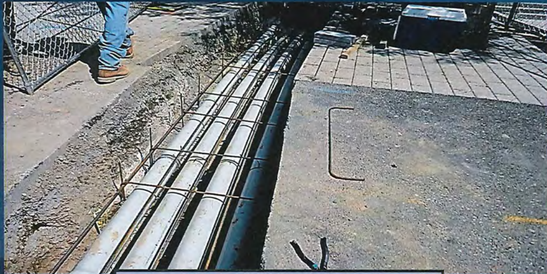
Upgrade Site Electric Distribution System (11.2 Million)