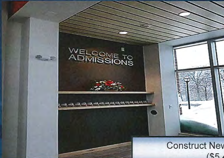
Construct New Welcome Center ($5.4 Million)