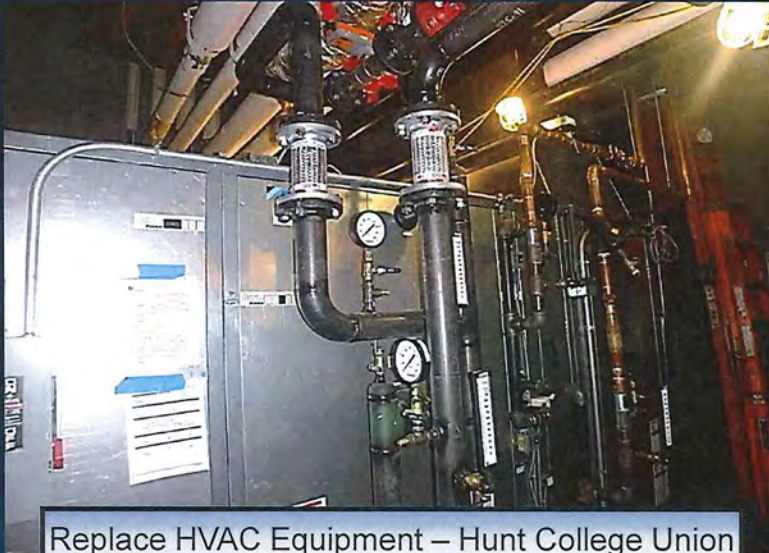
Replace HVAC Equipment – Hunt College Union ($5.6 Million)