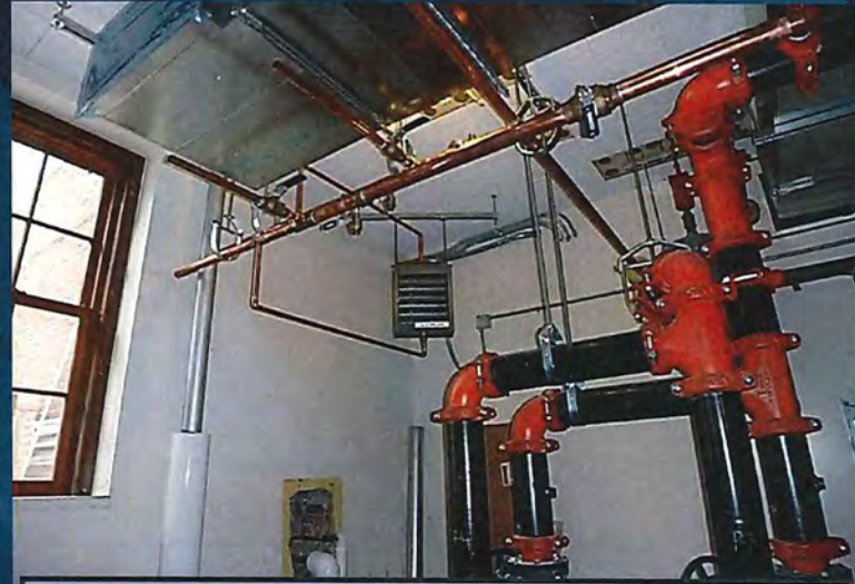
Upgrade Plumbing/HVAC Systems – Bugbee Hall ($6.0 Million)