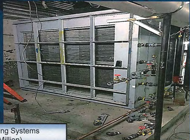
Rehab Building Systems ($26.5 Million)