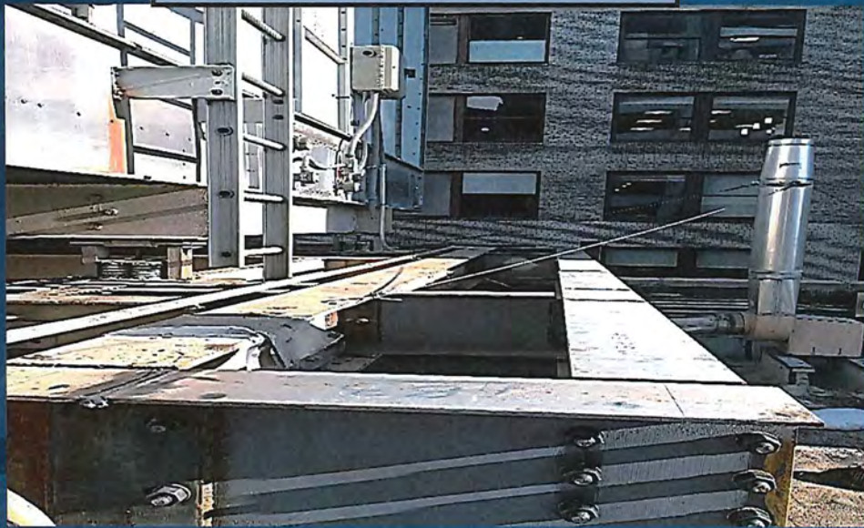
College of Optometry