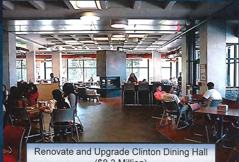
Renovate and Upgrade Clinton Dining Hall ($8.3 Million)