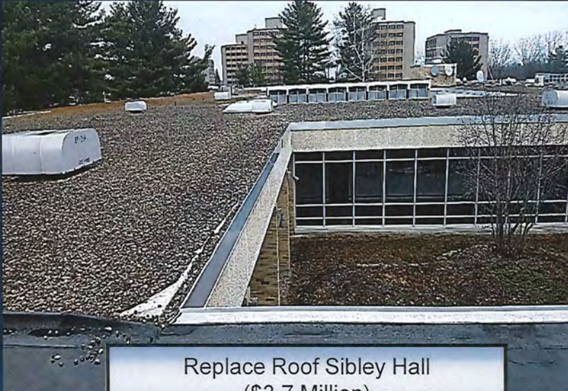
Replace Roof Sibley Hall ($3.7 Million)