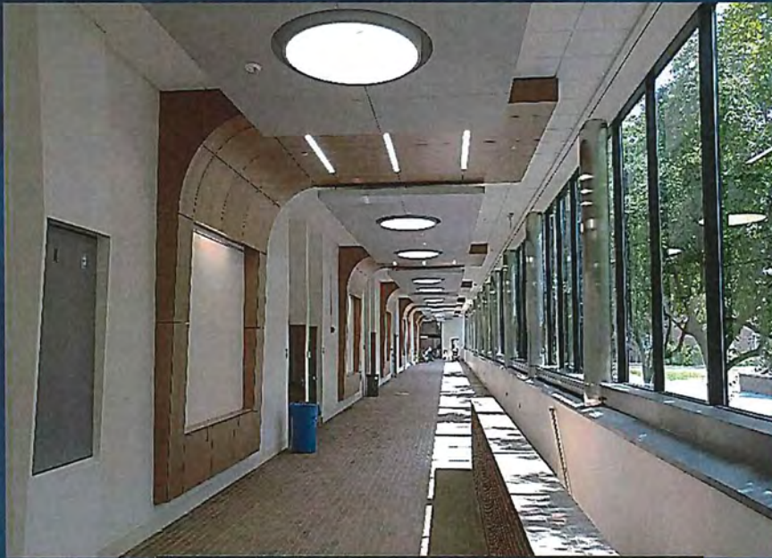
Rehab Kellas Hall ($8.3 Million)