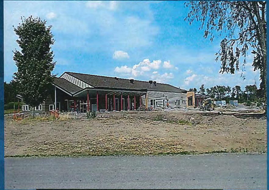
Construct Child Care Center ($6.0 Million)