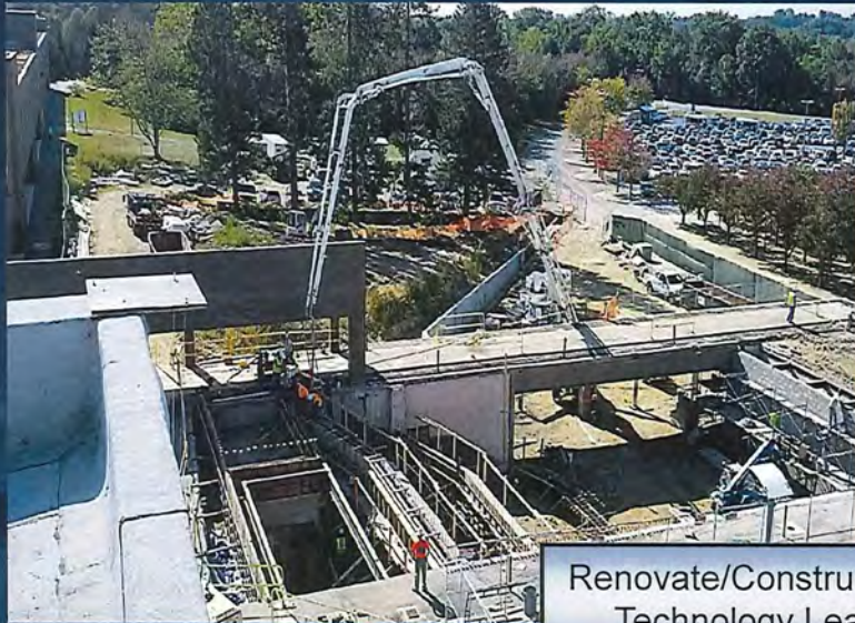
Renovate/Construct Center for Integrated Technology Learning ($42.9 Million)