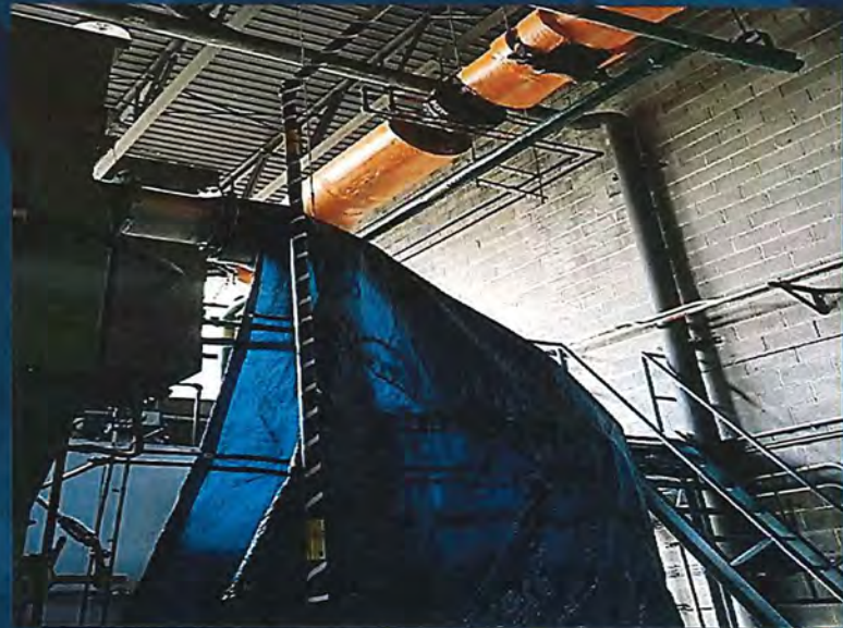
Rehab HTHW System Phase 2 ($11.0 Million)