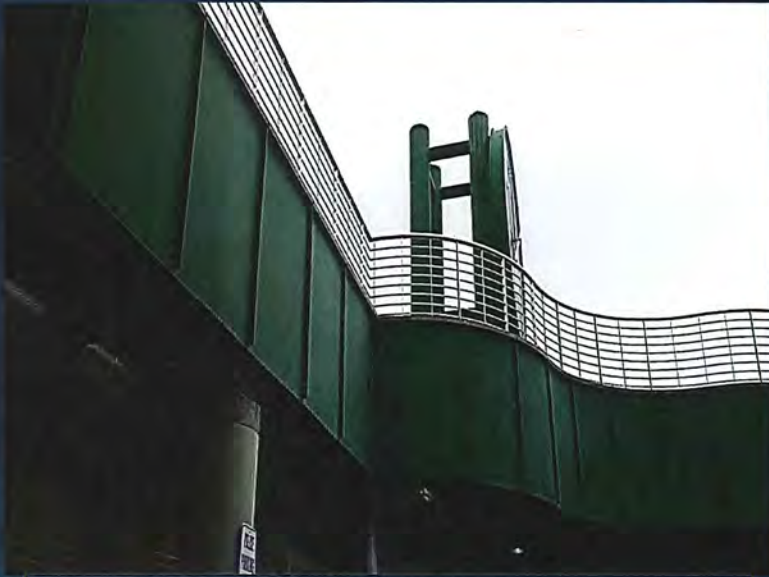
Rehab Diesel Generator ($3.5 Million)