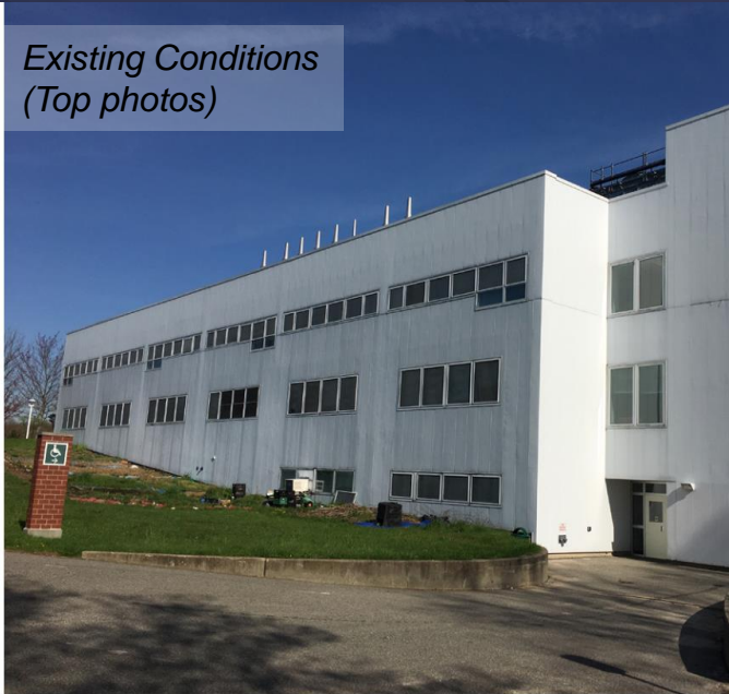
Existing Conditions (Top photos)