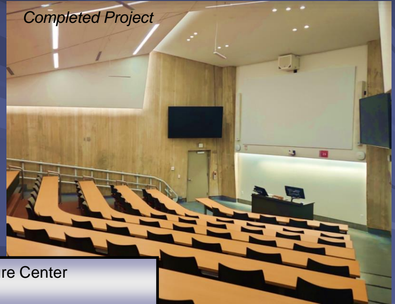
Rehabilitate Javits Lecture Center ($38.0 Million)