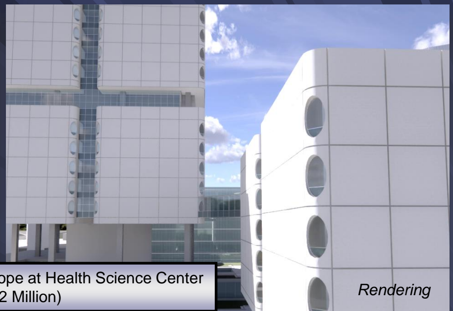
Rehabilitate Exterior Envelope at Health Science Center ($122.2 Million)