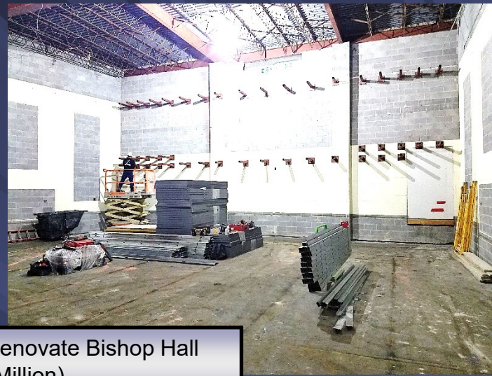
Construct Addition, Renovate Bishop Hall ($27.3 Million)